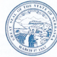
Pete Ricketts, Governor